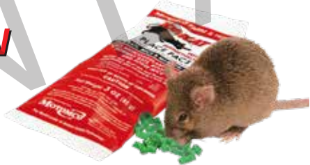
Photo is not representative of a label-consistent bait placement

This Product May Only be Used Inside and Within 100 Feet of Man-made Structures