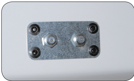
Grease fittings on fan housing exterior