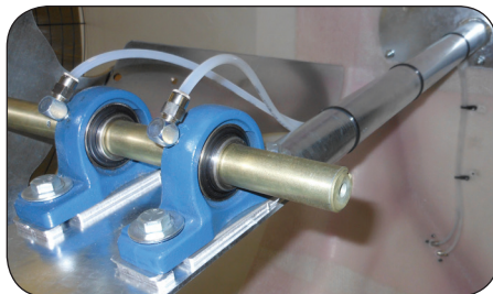
Grease lines connected to bearings