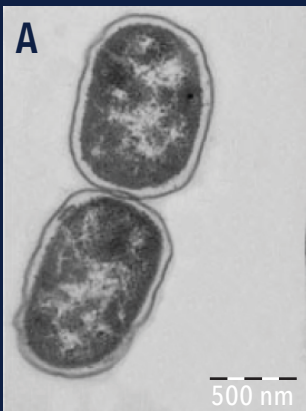
Viable Clostridium perfringens