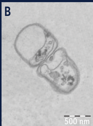
Killed Clostridium perfringens in the presence of Duodecim