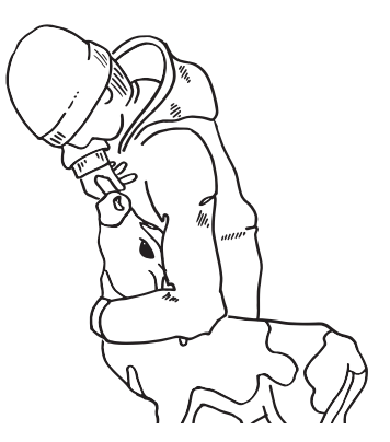
Step 4: Massage calf's throat while holding its head up to get the calf to swallow

Hold calf against your thigh with head up